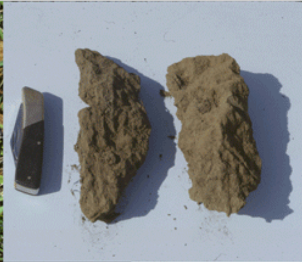
Figure 1. Examples of two types of soil structure: blocky and prismatic. Other types of soil structure include granular and platy (not shown).

In summary, soils can provide excellent wastewater treatment and it is one of the ecosystem services that soils provide for humankind. Identifying the most suitable soil on the property will save money and lead to the best long-term onsite wastewater system performance.