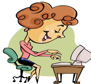
See us in the office to get your grain cards for harvest!!!

flex and minimum price contracts. Please check with us and let us help you take the most out of the marketplace. Let us help you put more money back in YOUR pocket. Call us today!